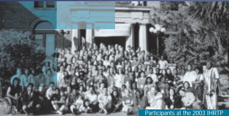
Participants at the 2003 IHRT

Established in 1967, the Canadian Human Rights Foundation is a non-profit, non governmental organization engaged in human rights education programs in Canada and around the globe.