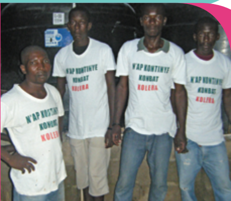
Young men from La Victoire in front of tanks of clean drinking water. Their shirts say: "We continue to fight cholera."

In Haiti — Equitas workshops and tools resulted in street youth in Cité Soleil forming groups to clean up their neighbourhoods and create safe places for children to play. After the cholera outbreak, in La Victoire, community members formed work teams to clean water sources, build